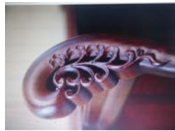
Figure 9. Flower chair armrest

The ice crack is the first crack in the firing process of porcelain. It shows the infinite natural beauty. The ice crack in the furniture is affected by the porcelain. In ancient times, ice cracks were often used to open the fence, doors and windows, and back of the bed by openwork or splicing. In today's Chinese furniture, ice cracks are used more widely. For example, it is used on the tabletop of the dining table, the surface of the coffee table, etc., and the texture interlacing makes people associate. As shown in Figure 12, the fence of the bed is decorated with ice patterns. The ice crack pattern looks like transparent ice, and it looks like a piece of plum, which has a strong artistic sense. [6]