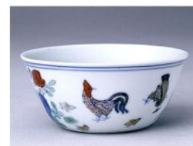
Figure 4. Animal Pattern in the Ming and Qing Dynasties