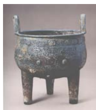
Figure 2. Animal Face in Western Zhou