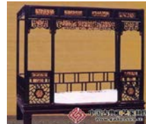
Figure 12. Ice pattern bed