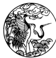
Figure 6. Animal Graphics