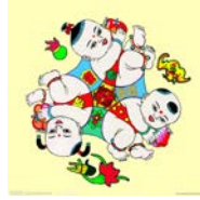
Figure 7. Figure Graphics