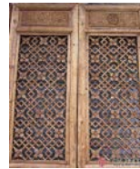
Figure 10. Square Door