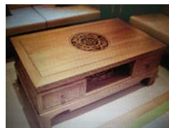
Figure 11. Patterned tea table