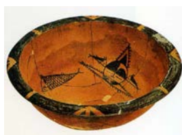
Figure 1. Banpo pottery pot

The subjects used in the Ming and Qing dynasties were in various forms, mainly based on auspicious graphics. Among them, the figures of auspicious animals include dragons, tigers, unicorns, etc. The motifs of auspicious plants include lotus in Buddhism, rich peony, chrysanthemums that symbolize longevity, and plum orchids and chrysanthemums that express integrity. The theme of the legendary story and characters are eight immortals, one hundred sons, five sons, etc., and the use of "Blessing, Wealth, Longevity and Fame" and other texts as the theme. The theme of the abstract geometric figures are "rolling cloud, ideogram, cloud, and crease". These Ming and Qing dynasties have auspicious meanings and express people's good wishes. [3] See Figure 4.