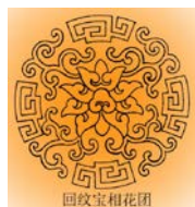
Figure 5. Plant Graphics

Geometry. Geometry is a geometric decorative pattern composed of various lines, curves, and circles, triangles, squares, diamonds, polygons, etc., which are a reasonable combination of points, lines, faces, black, white, and gray. The traditional geometric pattern has a pattern, a square pattern, a long pattern, a money pattern, a turtle pattern, a 4D pattern, a wishful pattern, and the like. Most of these figures indicate that people have a good yearning for things and life. They are auspicious figures. For example, the turtle's back and the four-character pattern mean longevity. The square-winning pattern is made up of diamonds, also known as longevity. [4] See Figure 8.